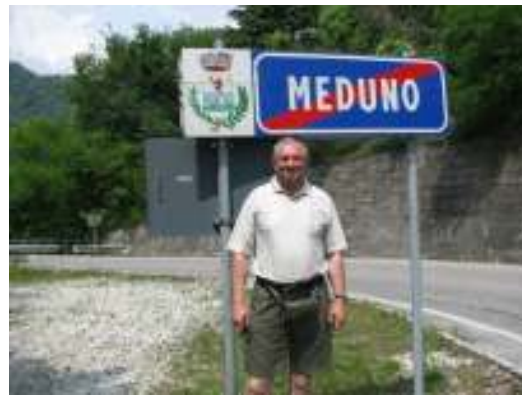
Meduno – end of the village(from opposite direction)