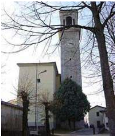
Church Santa Maria Maggiore