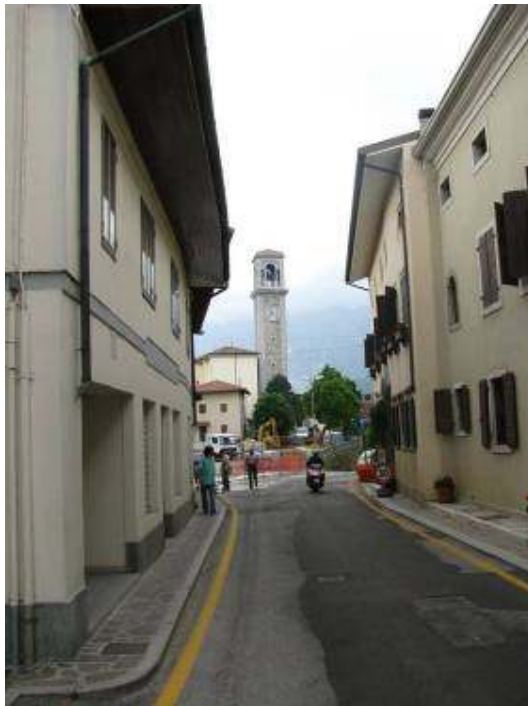
Main street view - direction to the Church