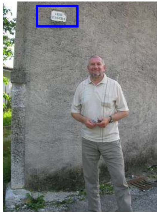
vicolo Bevilacqua – small One- way street in Meduno