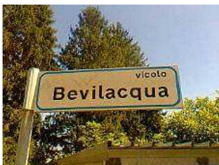
The One-Way street – vicolo Bevilacqua in Meduno