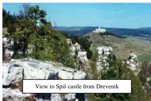
View to Spiš castle from Drevník