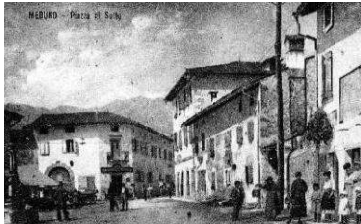
Piazza di Sotto a Meduno.